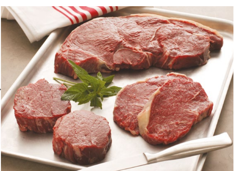
Edible meat = 40% (of liveweight)

The information in this brochure is based on a 303 kg carcase (side weight 151.5 kg), Classification R4H (after 2 weeks maturation).