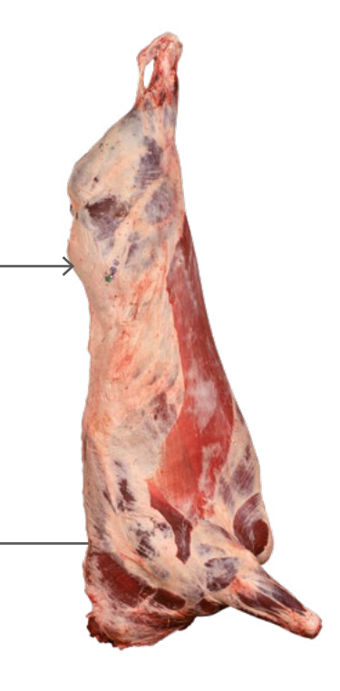
Bone / Fat / Waste = 13% (of liveweight)